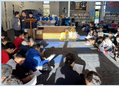
Started the day with a special Liturgy.