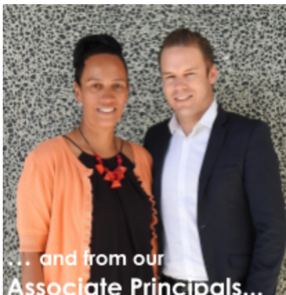
... and from our Associate Principals...

Parents and whanau most welcome to attend