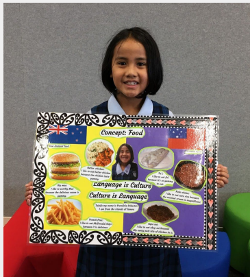
Erenderia - Tika Tuarua

Below are three of our wonderful bilingual/bicultural learners proudly displaying their amazing Duality Maps they have created with our ELA team. We look forward to seeing more duality maps from our tamariki.