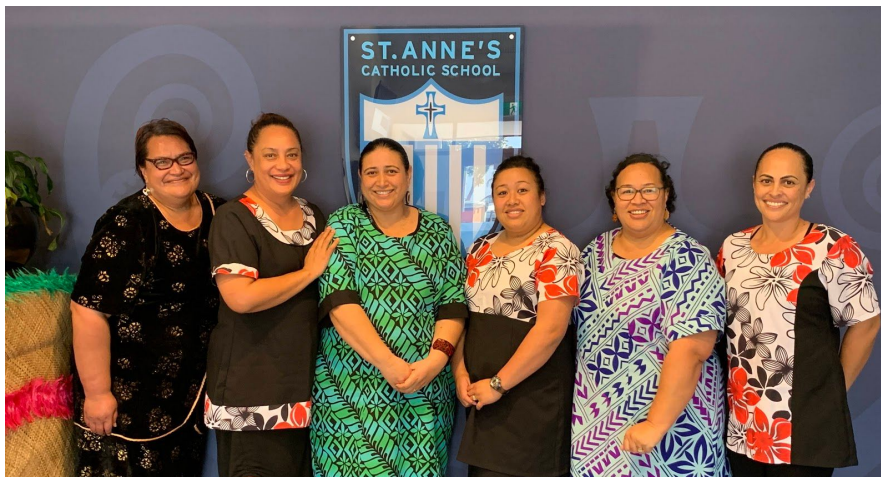
Faafetai Lava to our lovely staff who organised Samoan Language Week.

Please click here to view highlights video