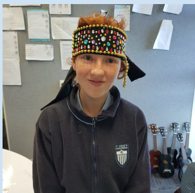
We created colourful ili (fans) and pale (headpieces).