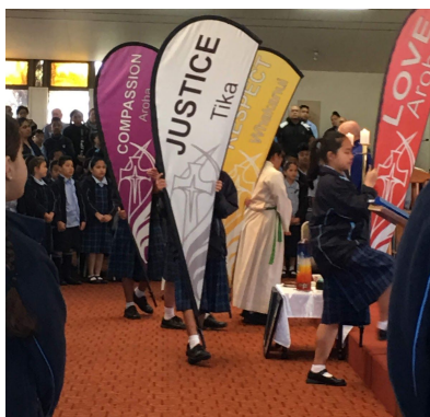
Mercy Day Mass & Activities

Our last week of last Term was a busy week - Mercy Day celebrations; superheroes mufti day raised $425 for the Hearing House; our school choir performed beautifully at Erin Park and our Year 7&8 girls basketball team competed hard at the Counties Zones basketball tournament.