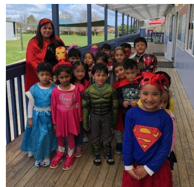
Superheroes Mufti Day