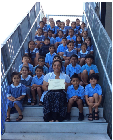
"We did it together!" Tika Tuatahi English Language Explorers.

A huge acknowledgement to all our St Anne's tamariki who have been part of our ELA journey. All the ELAs are so proud of all the 'treasures' of our school who have worked hard and grown so much in their English Language Learning.