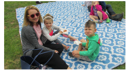
Some of our families/whanau enjoying picnic time together