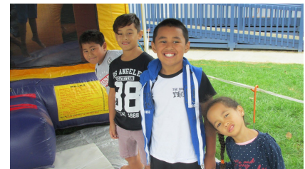
Nga mihi SKids, SWiS and our PTFA for supporting our evening.