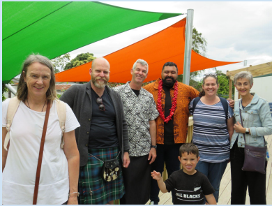
Current and past Board Members