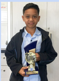
Week 4 - Fayezeian